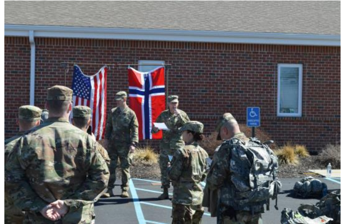
Awards being passed out at the end of the event.