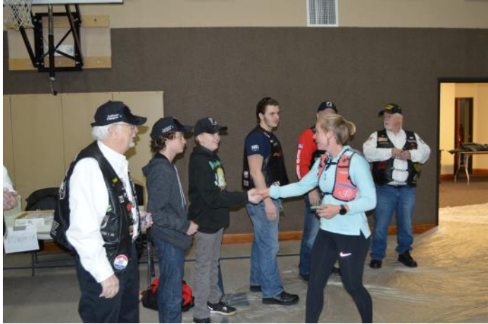
First Runner that crossed the finish line