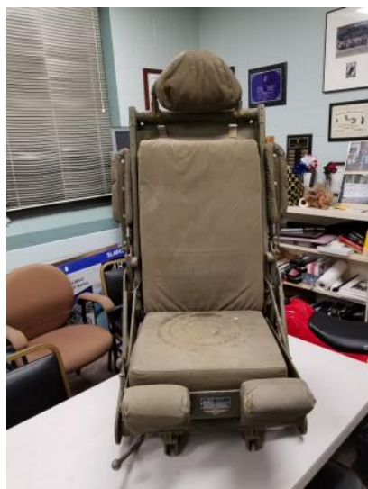
Grissom COH Before

Grissom Air Force Base Museum. The museum provided a seat from a C119 plane that will be used for the POW*MIA Chair of Honor. This seat will be a little more challenging and will require more work. The Blue Angels is scheduled to appear September 7-8 at the Grissom's Air and Space Expo. We are hoping to have the POW*MIA Chair of Honor display completed by September so the Chair can be dedicated during the expo.