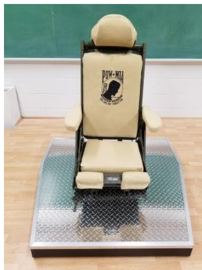
Grissom COH After