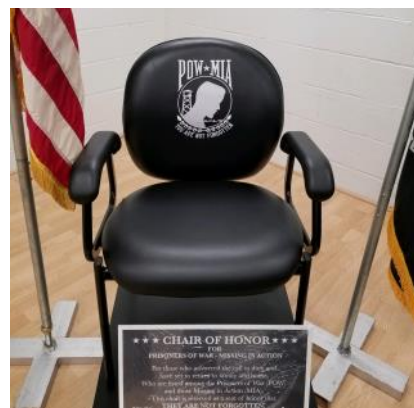
Indiana Veterans Memorial Cemetery COH.