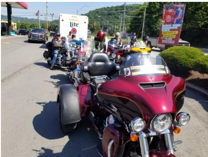
Fuel stop at Morgantown, WV