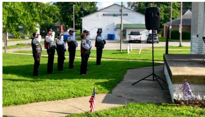
Pledge of Allegiance and National Anthem