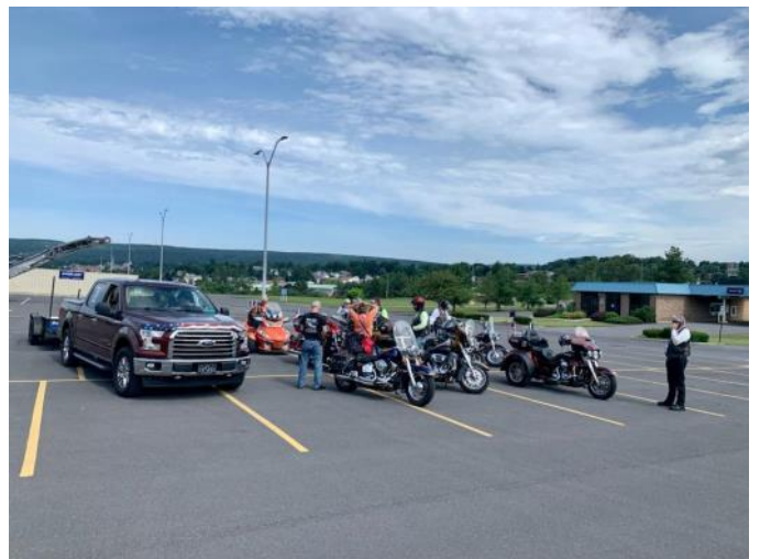
Lunch stop at Frostburg, MD