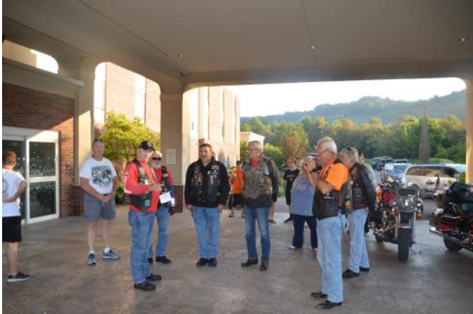
Morning briefing before departure.

The group had a early morning start in Athens with breakfast at the hotel and departure to Washington DC at 07:30. The journey from Athens, OH to Washington DC was approximately 358 miles. The weather was great and the countryside through the hills was awesome.