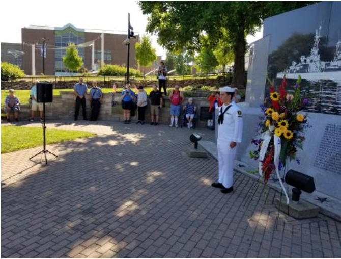
CA-35 Sea Cadet Standing tall during the Ceremony