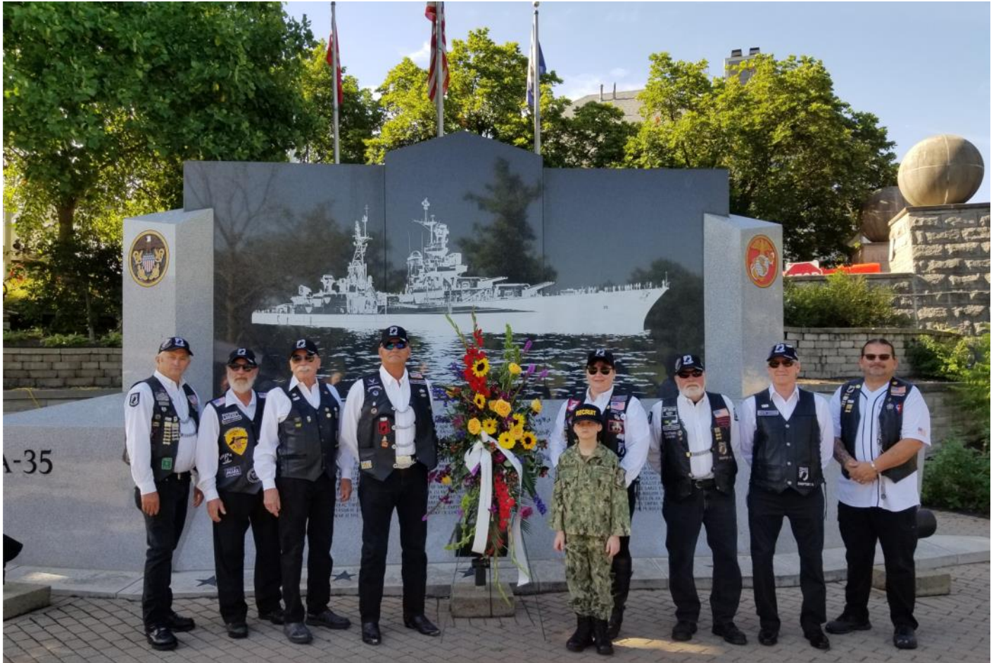
Group picture at the USS Indianapolis Memorial

There were 31 Hoosiers lost that day. Chapter members honored the 31 Hoosiers by reading their names and BIO's. The members did and excellent job and represented the Chapter well.