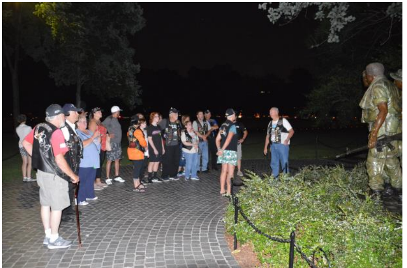
Briefing at the Three Soldiers Statue.