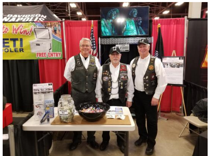
2018 Motorcycle EXPO