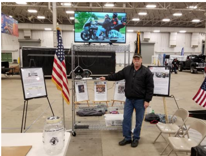
2018 World of Wheels

See next page for detailed information on the raffle prize.