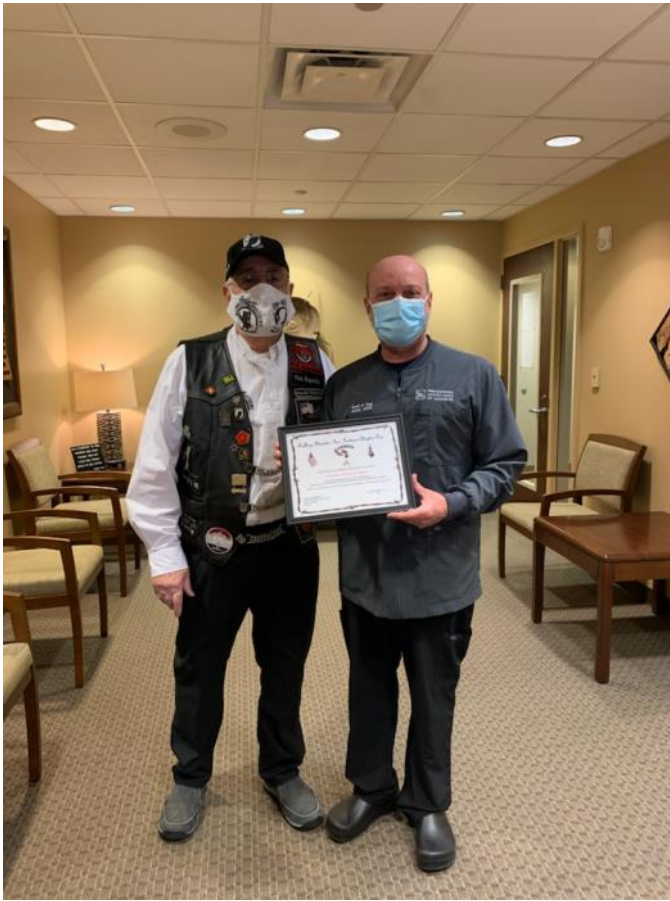
Periodontal Associates of Lafayette