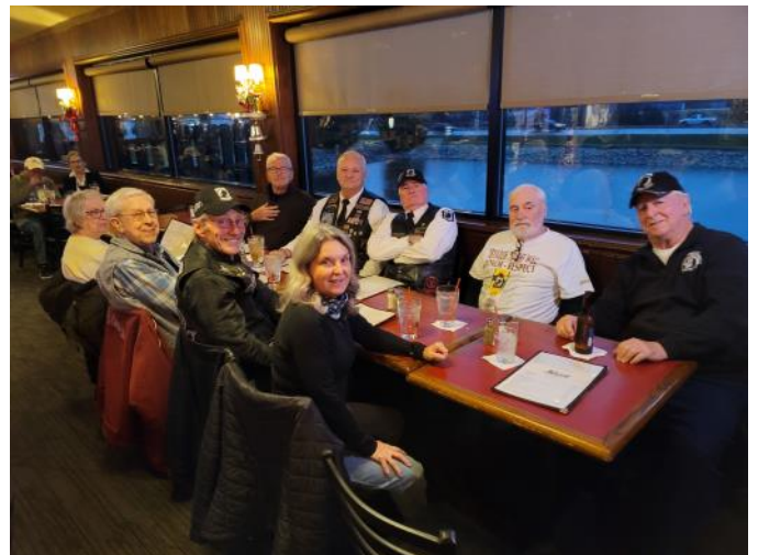
Members enjoyed a good meal at the Coachman prior to the ceremony.