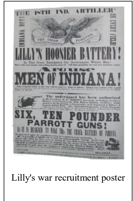
Lilly's war recruitment poster

In early 1862 Lilly actively recruited volunteers for his unit among his classmates, friends, local merchants and farmers. He had recruitment posters created and posted them around Indianapolis, promising to form the "crack battery of Indiana". His unit, the 18th Battery, Indiana Light Artillery, was known as the Lilly Battery and consisted of six, three-inch ordinance rifles and 150 men. Lilly was commissioned as a captain in the unit. The 18th Indiana mustered into service at Camp Morton in Indianapolis on August 6, 1862, and spent a brief time drilling before it was sent into battle under Major General William Rosecrans in Kentucky and Tennessee. Lilly's artillery unit was transferred to the Lightning Brigade, a mounted infantry under the command of Colonel, later General, John T. Wilder on December 16, 1862.