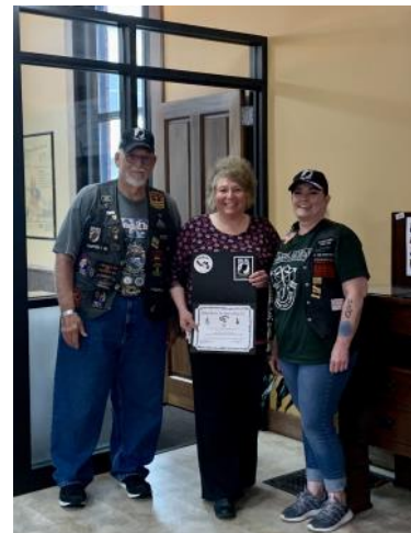
Industrial Federal Credit Union