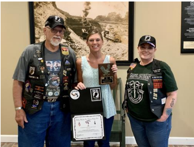
CentreBank, Veedersburg IN