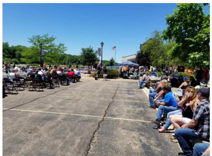
Ceremony at the memorial after the run.