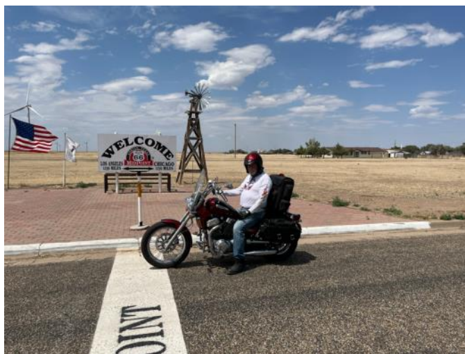
Made the midway point on June 13th