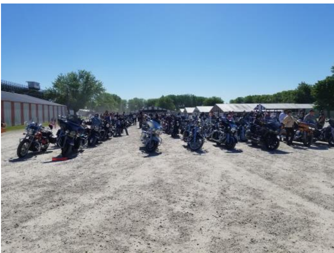
Staging at the Grundy Fair Grounds