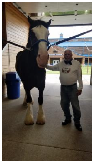
22,000 pound Clydesdale