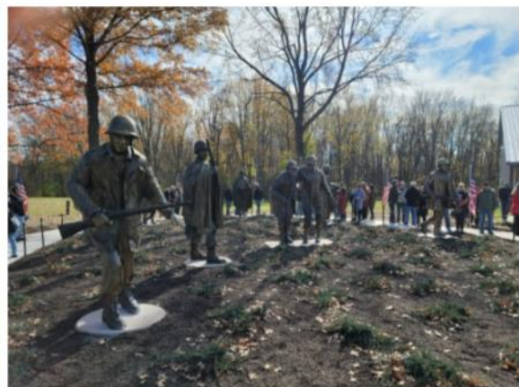
Korean War Memorial