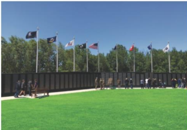
Vietnam Veterans Memorial Wall

Visit our website at www.indianarollingthunder.com or