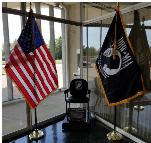
Indiana Veterans Memorial Cemetery September 14, 2019