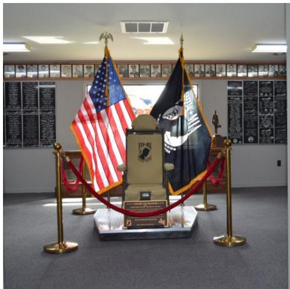
Grissom Air Force Base Museum September 7, 2019

In September 2019, we had three POW*MIA Chairs of Honor dedications at three different venues. The Grissom Air Force Museum Peru Indiana, Indiana Veterans Memorial Cemetery Madison Indiana, and the Plainfield High School Plainfield, Indiana. These special chairs will be seen by many people throughout the years to remind them that not all have come home and to Never Forget our Nations POWs and MIAs. The Chapter can be proud of these accomplishments.