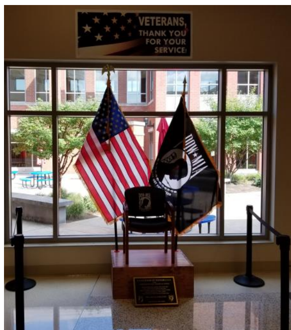
Plainfield High School September 19, 2019