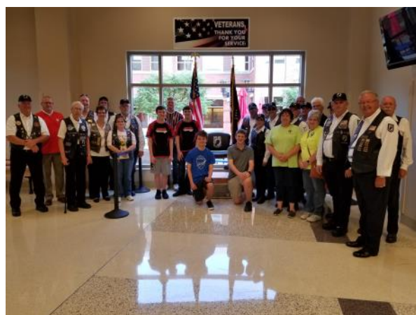
Plainfield students that built the platform for the POW*MIA Chair of Honor to sit on. They did an awesome job on the platform.