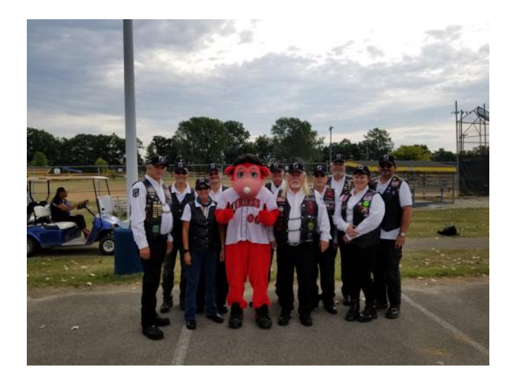
Chapter Members with the Indianapolis Indians Mascot Rowdy.

It was a good opportunity for the Chapter to show our support to the Local Community.