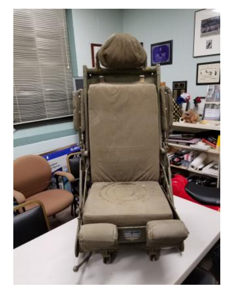
Grissom COH Before

Grissom Air Force Base Museum. Dedication date is September 7, 2019. Indiana Veterans Memorial Cemetery—Dedication date is September 14, 2019. Plainfield High School. Dedication date is September 19, 2019.