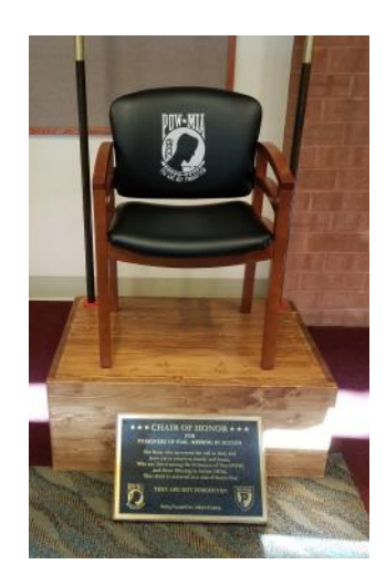
Plainfield High School COH. The Platform was built by the Plainfield High School Students.