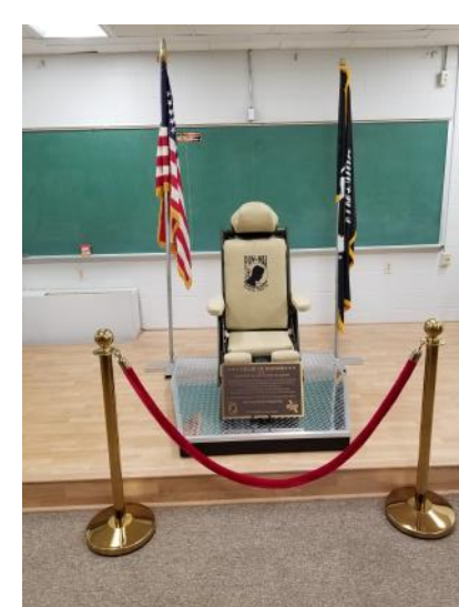
Grissom COH After