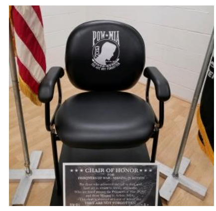
Indiana Veterans Memorial Cemetery COH.