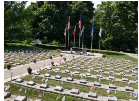
Fallen Hoosier Heroes Memorial, Westfield Indiana