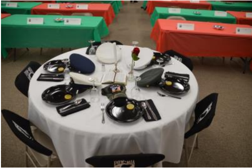
Missing Man Table